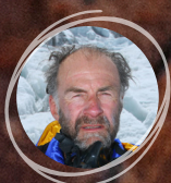
Sir Ranulph Fiennes

Also featuring live music from Vagaband ; craft beer and cider; prosecco; award-winning sodas; free wood-oven pizza; and informal chats with the speakers around the Campfire.